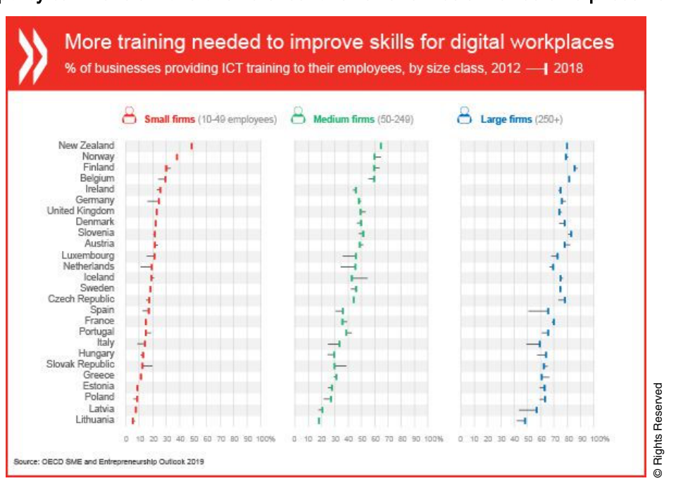
Chart for How policy can make a world of difference for SMEs - chart title: More training needed to improve skills for digital workplaces.

How policy can make a world of difference for small and medium-sized enterprises - chart