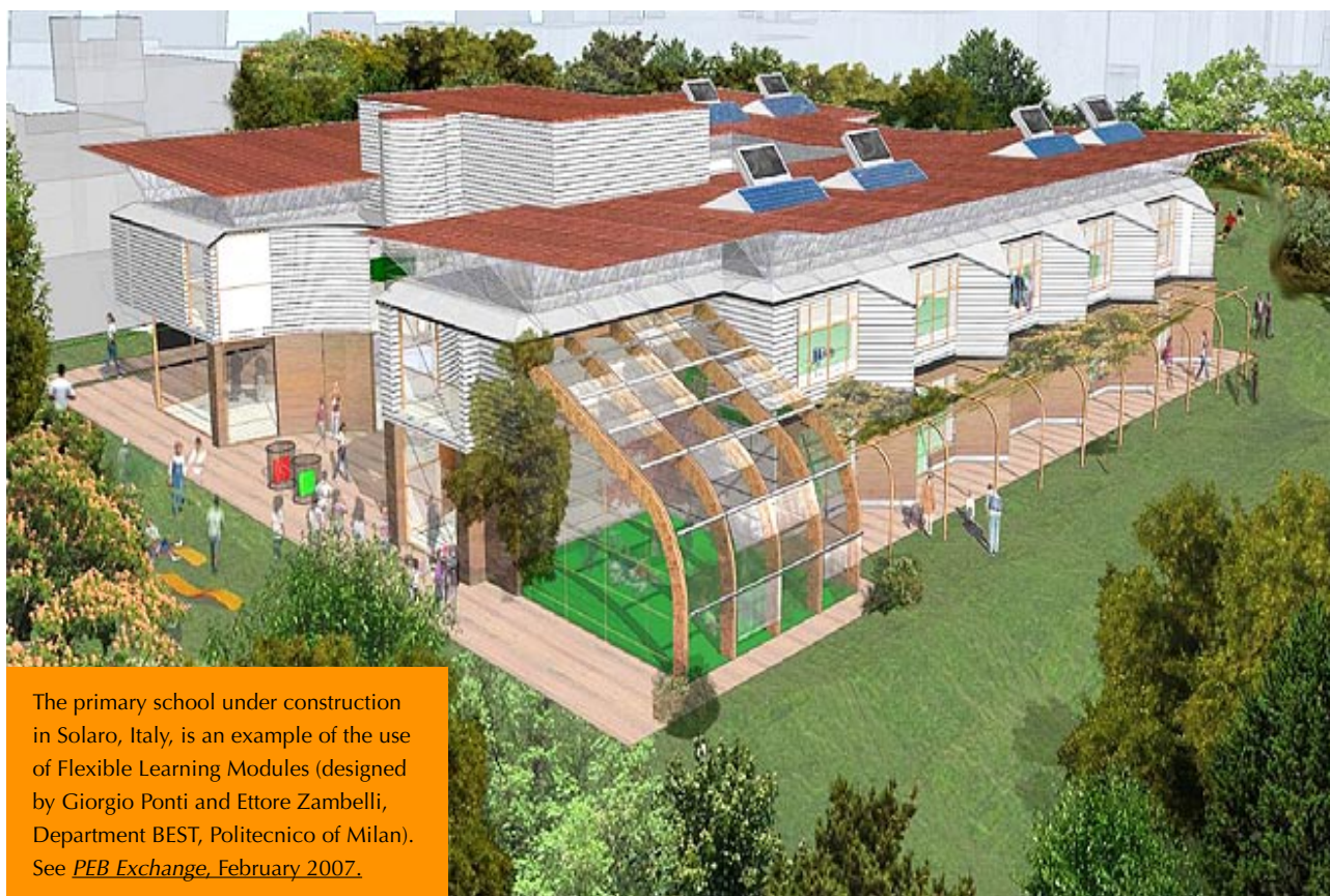
The primary school under construction in Solaro, Italy, is an example of the use of Flexible Learning Modules (designed by Giorgio Ponti and Ettore Zambelli, Department BEST, Politecnico of Milan). See PEB Exchange , February 2007.

The initial budget for designing and building the prototypes is expected to be EUR 36 million.