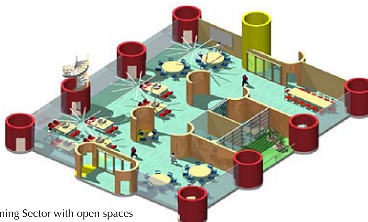
A Flexible Learning Sector with open spaces

The Flexible Learning Module (FLM) serves as the basis for the schools to be built under the EQF project. It is a single unit space able to accommodate 25 to 30 users. The basic module measures approximately 50 m 2 and can be expanded to 75 m 2 . It is equipped with full services and with a CIB (Computer Integrated Building) system. Natural ventilation and the most modern technologies to support teaching and learning complete the quality standard of this educational space.