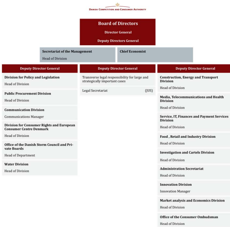
Figure 1. Danish Competition and Consumer Authority organisational chart

The organisational chart (below) reflects which deputy directors the different divisions in the DCCA refer to and the wide scope of DCCA Competition Act and Ministerial responsibilities.