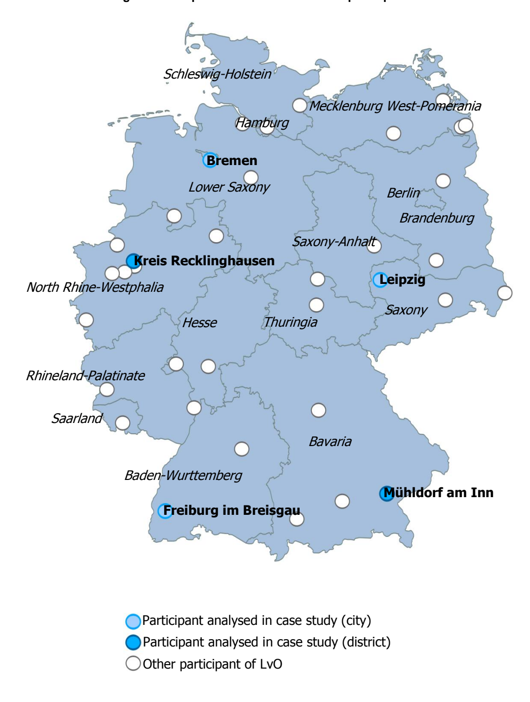
Figure 3.1: Map of districts and cities that participate in LvO

Figure 3.1 presents an overview over the distribution of participating districts and municipalities across Germany, highlighting the municipalities analysed in detail in this study.