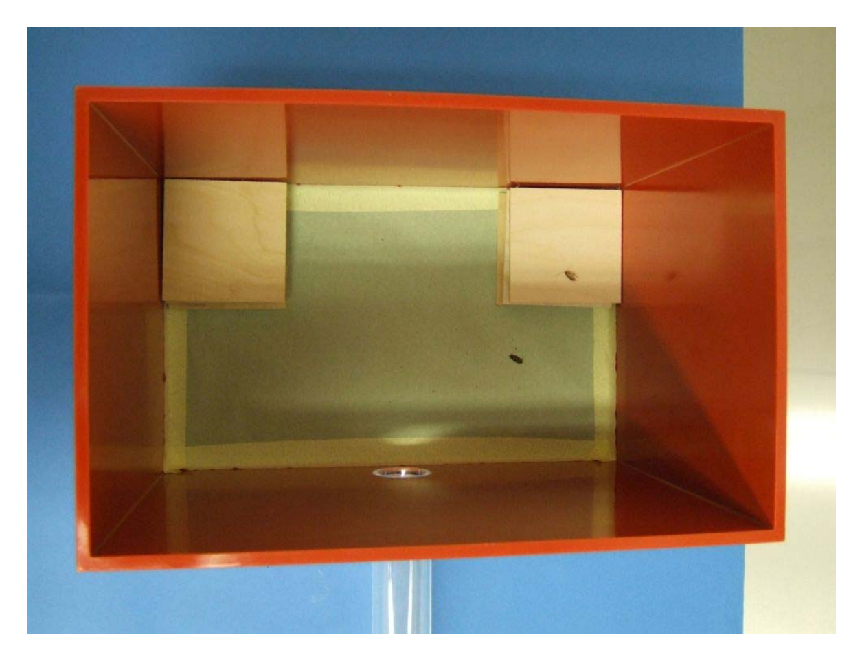
Figure 2 Arenas for testing cockroach baits: harbourage unit of dual chamber box, top view