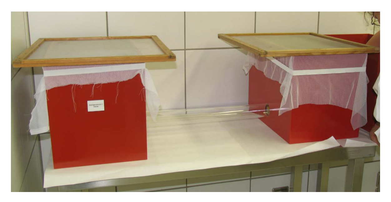
Figure 1. Arenas for testing cockroach baits: dual chamber box with rectangular units, side view