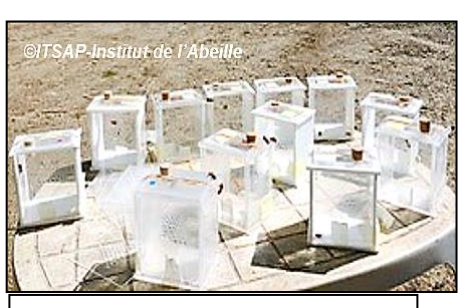
Honey bee release

Exposure occurs in the dark. The light is for taking a photo only