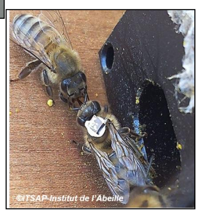
Tagged bee on flight board RFID reader with tunnel to scan labelled bees entering/exiting the hive (MAJA 13.56 MHz, Microsensys, GmbH, Germany)

It is recommended to perform the release phase in the shade in hot climates.