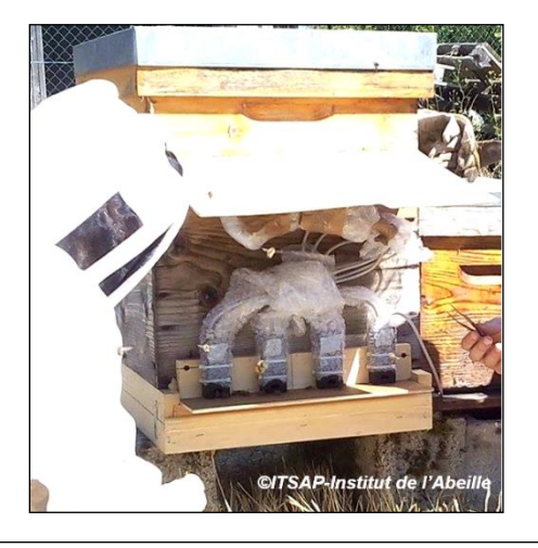
Capture at the hive entrance Hive is equipped with the RFID system (MAJA 13.56 MHz, Microsensys, GmbH, Germany)