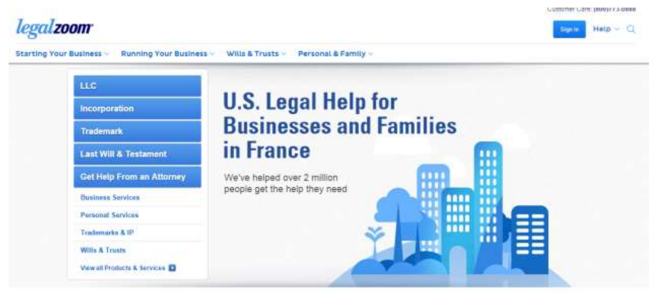
Figure 2. LegalZoom