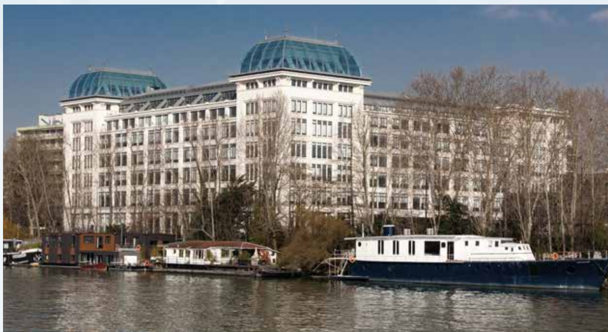
OECD office, Boulogne-Billancourt, near Paris.