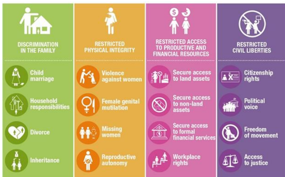
Figure A A.1. The composition of the SIGI 2019