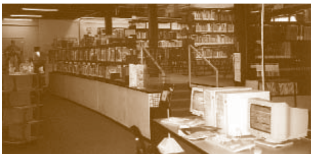
The municipal library

mation of any kind. The library also provides photocopying services and services for reproducing photographs in the cultural centre's archive and for duplicating the audio-visual materials produced by the cultural centre.