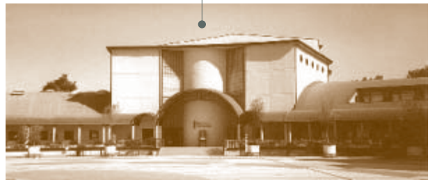
The Teatro della Regina with the municipal library to its left

To contact the City of Cattolica: Piazza Roosevelt 5 47841 Cattolica RN Tel.: 39 0541 966511 Web site: www.cattolica.net